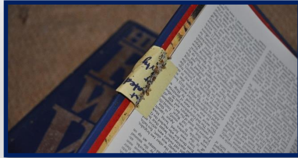
*Bed Bugs found within a library book

A: Be sure during travel, that luggage never touches the bed. Place all luggage on the luggage rack or in a room such as the bathroom. Place dirty clothes inside a trash bag inside your suitcase and when you arrive home, wash all clothing right away. Try to avoid bringing your luggage inside your home, a garage is preferred. If luggage absolutely has to be brought inside ensure that it never goes in the bedroom or on furniture.