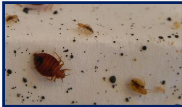
*Bed Bugs at all stages of life