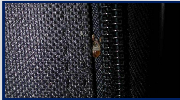
*Bed Bugs found on luggage